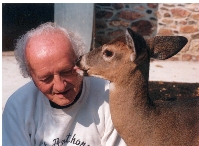
Father at St. Anthony-in-the-Hills with a friend.